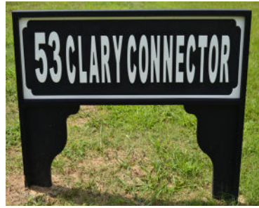
1 Year Exposure Sheet