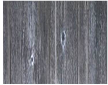
5 Year Exposure Wood