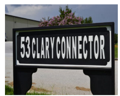
5 Year Exposure Sheet